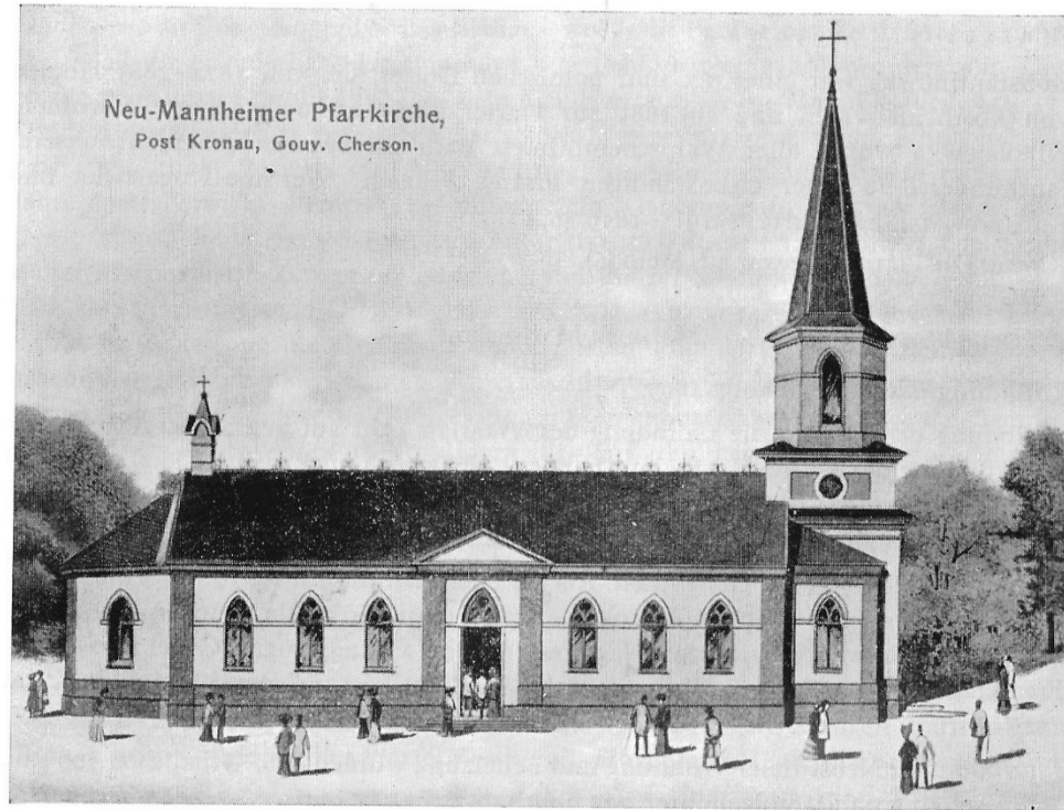
212. Neu-Mannheim. Pfarrkirche, erbaut in klassizistischem Stil

Kirche: Um das Jahr 1880 erbaute N-M. ein Bethaus, das erste Gotteshaus im Molotschnaer Siedlungsraum. Die nachmalige Pfarrkirche war trotz der neogotischen Fenster eine typisch klassizistische Kirche; sie wäre gut in Südwestdeutschland denkbar gewesen und läßt sich mit der Pfarrkirche in Dornheim bei Darmstadt vergleichen (erbaut 1810–1834). Zur inneren Ausschmückung bestellte Pfarrer Malinowski 1910 bei der Kunstanstalt Stuflesser eine Rosenkranzkönigin-Statue (160 cm hoch) mit Bordüre für 90 Rbl.