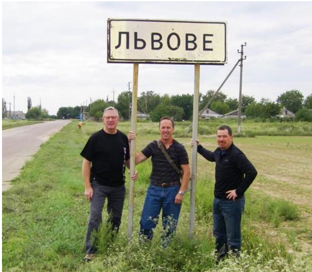
Lvove, Ukraine. 31 August 2012